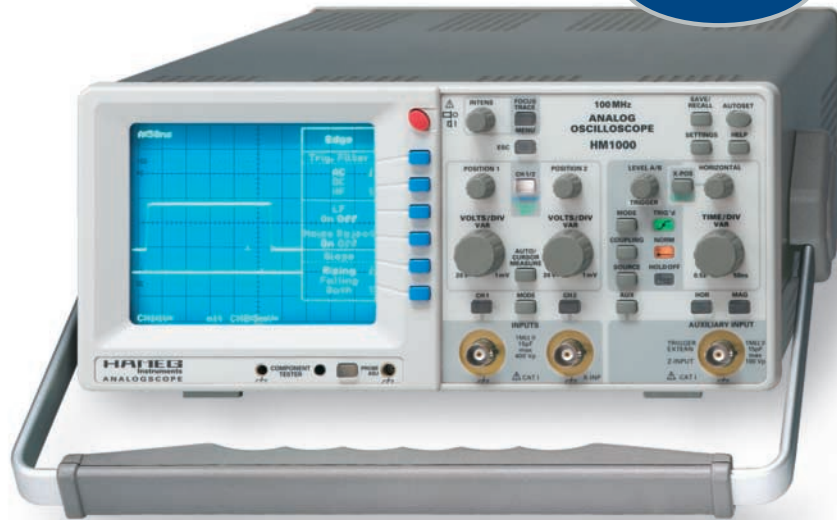
Undistorted display of a 100 MHz sine wave signal